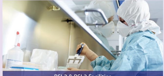
BSL2 & BSL3 Facilities