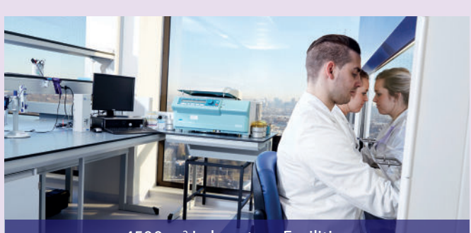
4500 m<sup>2</sup> Laboratory Facilities

CLINICAL TRIAL OPERATIONS SERVICES consist of preparing and designing virology sampling kits, courier transport coordination, sample tracking and tracing (guaranteeing temperature controlled supply chain and online-sample timelines), management and training of sample processing labs.